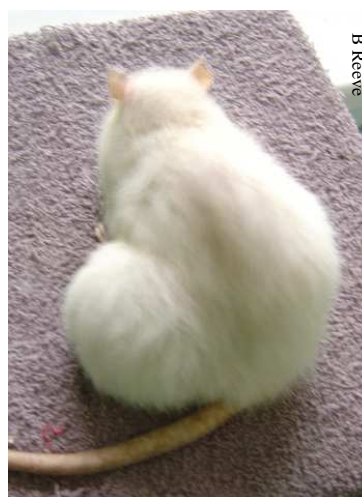
Bev's doe Angelina with a fairly typical large tumour on her left flank