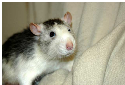
Diss 2005